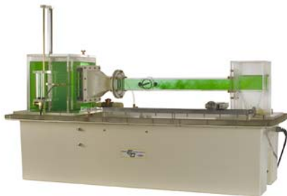
The flowLab is a complete water tunnel that can sit on a sturdy workbench or desk.