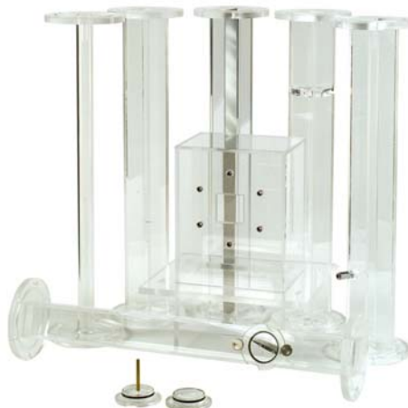
A variety of test sections are available and can be changed in minutes.